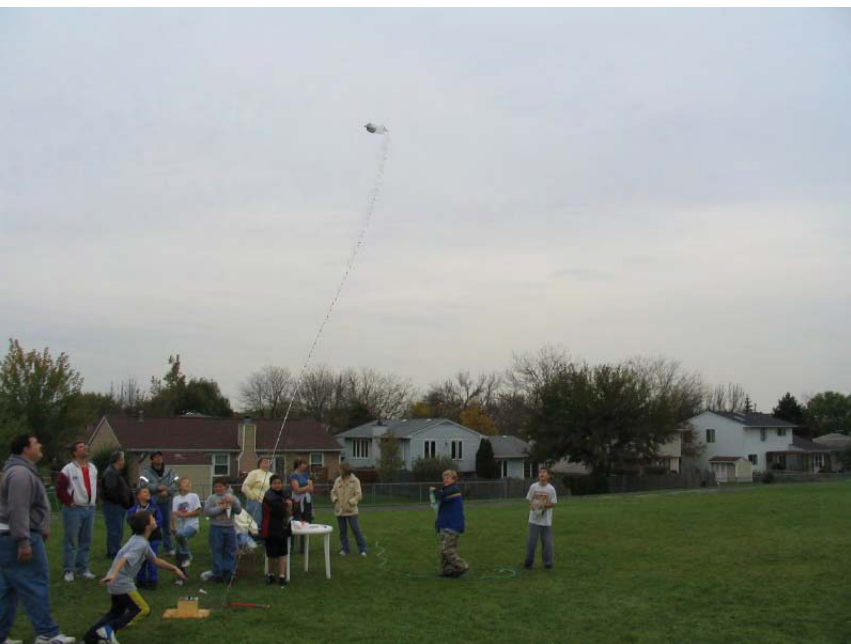
Water Bottle Rocket Launch