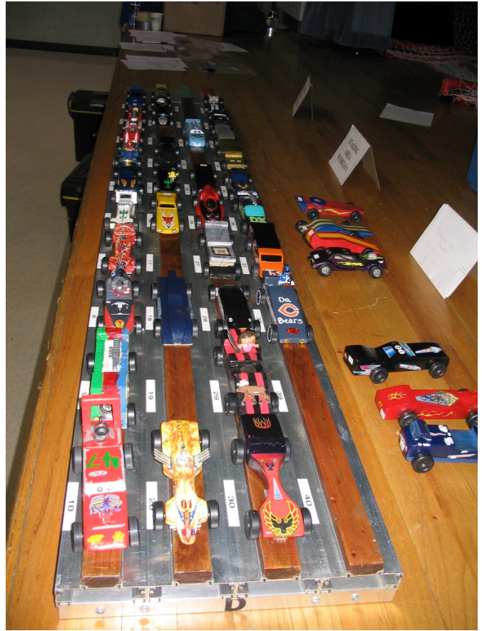
Pinewood Derby 2007