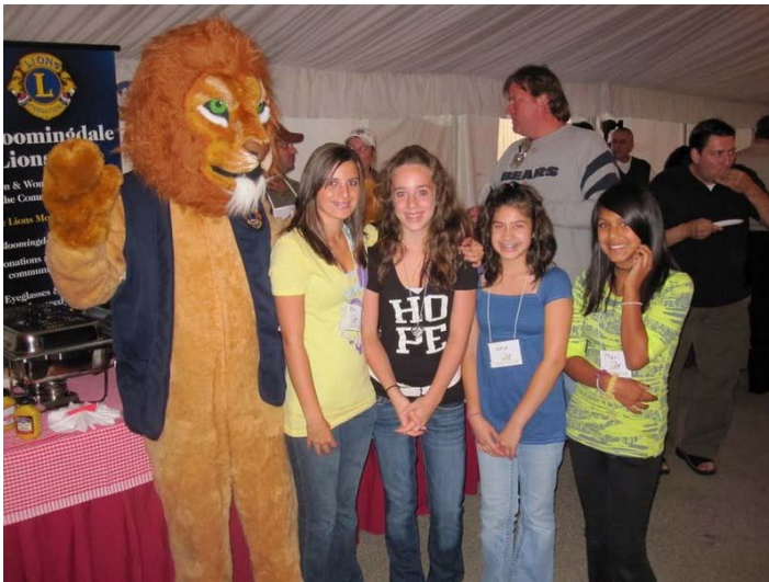
The Bloomingdale Westfield Leos and "the Bloomingdale Lion" were in attendance at the Chamber's "50 Men Who Can Cook" fundraiser.

The Union Lioness Club's Nov. Feather Party is progressing. Raffle tickets have been handed out. There was a great turn-out for the Lion/Lioness Picnic (family) in Aug. The club participated in the Union Days Picnic in Sept. and are planning for the Oct. Pet Parade.