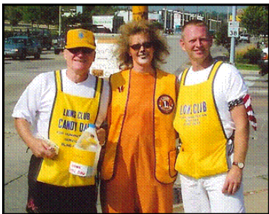
A photo that appeared in the Crystal Lake Lions Club newsletter, the Pride, of three CL Lions ready for Candy Day -- wish we'd had that kind of beautiful weather! Oh well, there's next year!