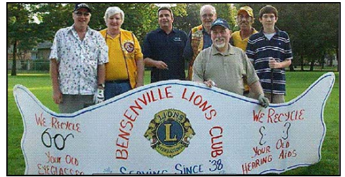
The Bensenville Lions worked with eight other local organizations in town to make the Golf Challenge a success.