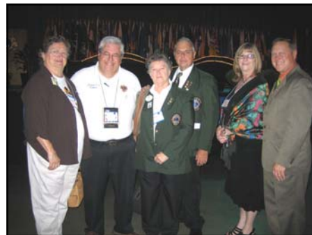
1-J at the USA/Canada Forum